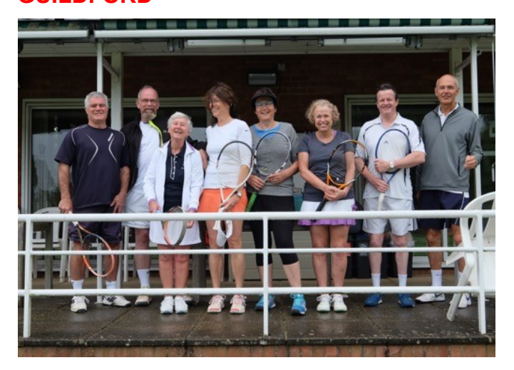
Freiburg and Guildford players at Pit Farm tennis club

In 2014 four tennis players from Guildford's Pit Farm tennis club visited Freiburg to play two friendly matches against the two tennis clubs in the town. Fast forward two years and in July four members of Schönberg Tennis Club arrived for their first visit to Guildford. They