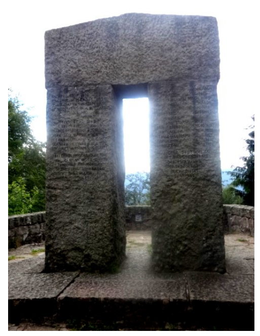
Engländer Denkmal: memorial put up by the Nazis.

The Guardian newspaper of 6 July 2016, 80 years later, included a full report on the incident. It reveals the horror of the disaster, including the frightful unprepared recklessness of the lone teacher leading a party of 27 14-year-olds - he scornfully dismissed every bad weather warning and offer of sanctuary (reconciling the modern reader to all the annoyances of Health & Safety legislation) – the propaganda value to the Nazis, and the political sensitivities which prevented any British investigation. A fascinating read: see the Guardian website.