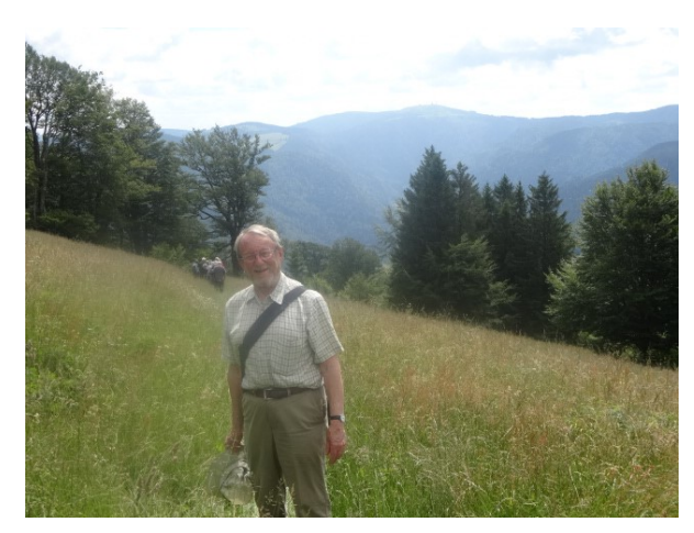
Top and r: cable-car and walk on Schauinsland with the Anglo-German Club; Below and bottom I: dinner at the Dattler Restaurant with the Club Bottom r: refreshments after the walk