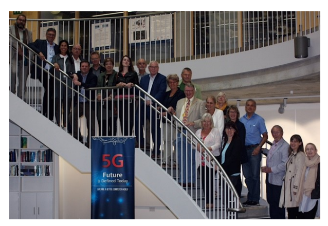
University of Surrey: Engineering Department (I); 5G Centre (r)